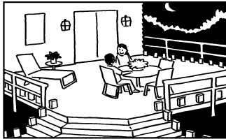
Patio and Deck